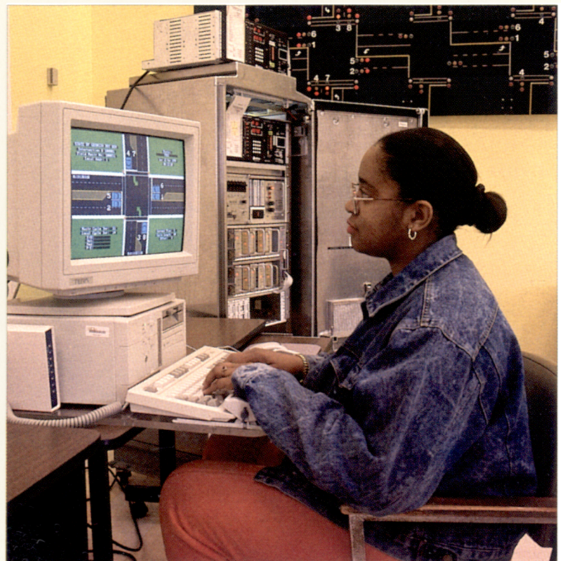
Participants in Georgia Tech continuing education workshops often receive hands-on experience at campus transportation facilities.

Tech's Continuing Education Department offers short courses and workshops on traffic signal engineering, operation, timing and analysis.