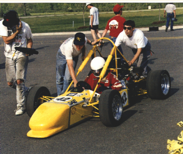
Students in a Georgia Tech motorsports club build an open-wheeled race car for an annual design competition.

Georgia Tech is assisting the Georgia Department of Transportation (GDOT) in planning for implementation of the seven systems mandated by the Intermodal Surface Transportation Efficiency Act (ISTEA). As implemented, these seven systems will become an integral part of the state's decision-making process. This project will also provide an overall strategic plan with individual office implementation plans for a GDOT information system that handles all data used by the department including management information. When completed, GDOT will have the architectural concept in place for a fully automated department including the district offices.