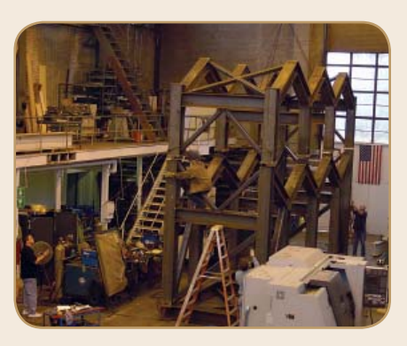
This large frame is part of the Eglin AFB wind tunnel.

Machine Services uses three different types of programming and design software – SurfCAM, AutoCAD and Solid Works – and has more than 90 different tools at its disposal, including a Safop lathe that can swing more than 60 inches