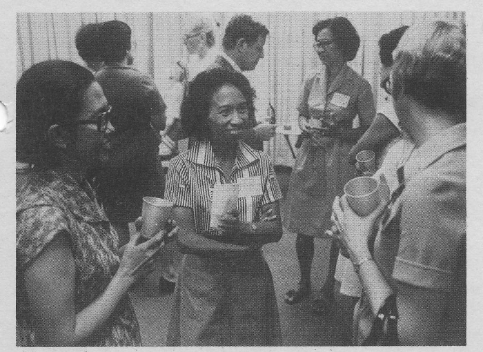
Reception for Indonesian information specialists studying at EED